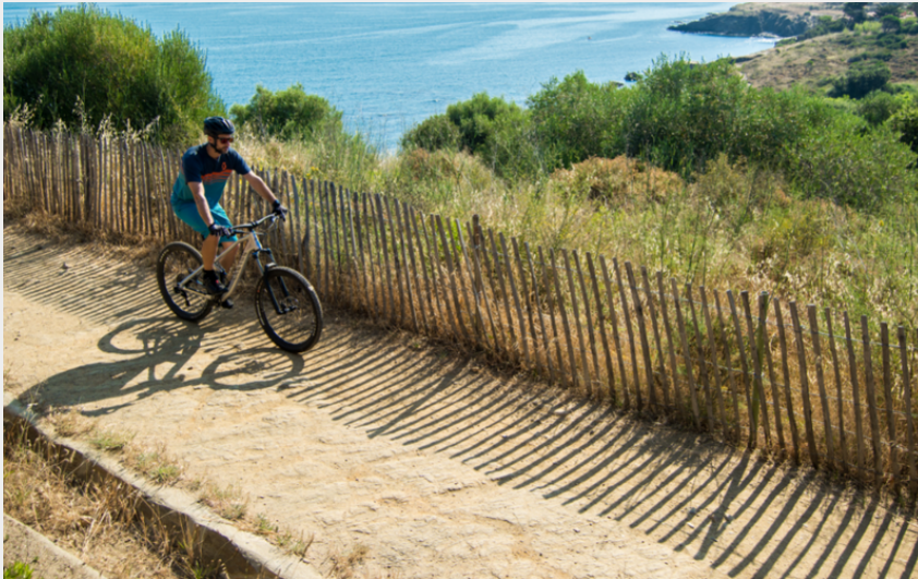
(OMT Argeles sur mer)