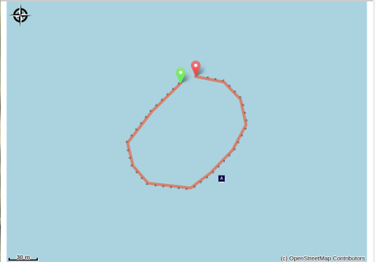
Blennie (Aquatile plongée)