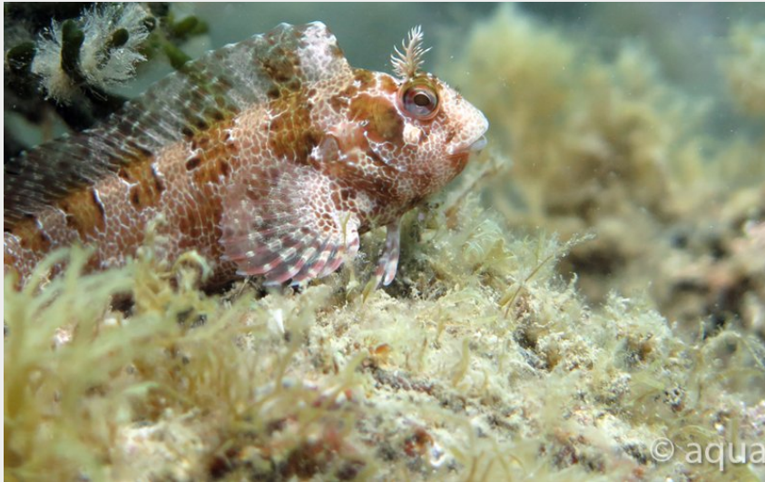
Blennie (Aquatile plongée)