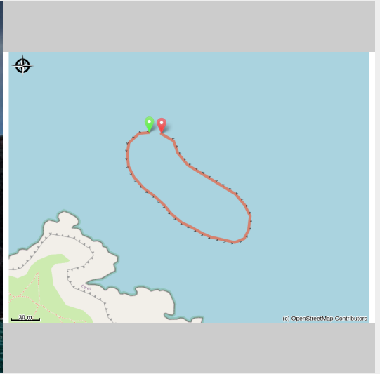
Cap Cerbère (Plongée Cap Cerbère)