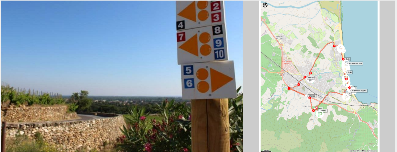
Signalétique VTT (Mairie D'Argelès-sur-Mer)