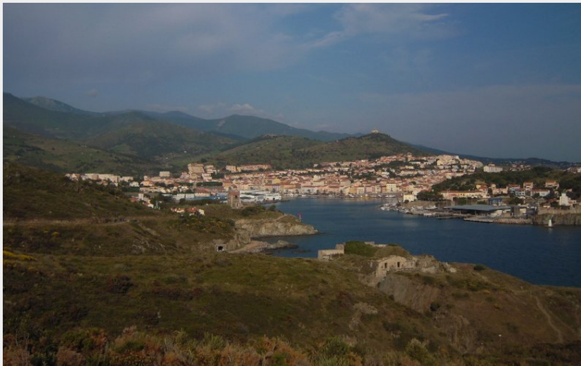
Port-Vendres vu du Cap Béar (CCACVI)