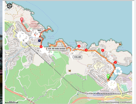
Collioure (Valery Zavidovich)