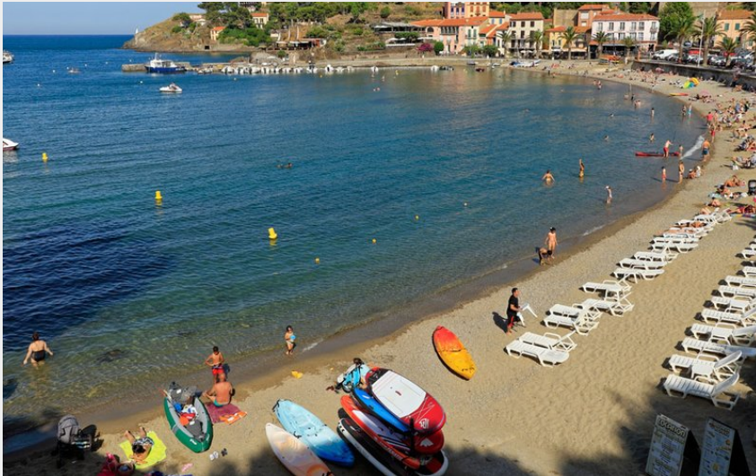
vue de Collioure (Frédéric Hédelin)