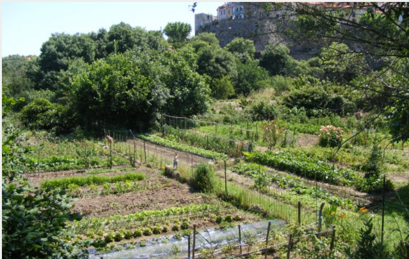
Jardin Laroque (ot Laroque)