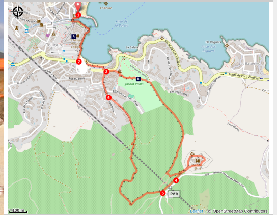
Château Royal de Collioure (elcoste)

Collioure will enchant you, from the Royal Castle to Fort Saint-Elme, with a delightful stop at the windmill along the way!