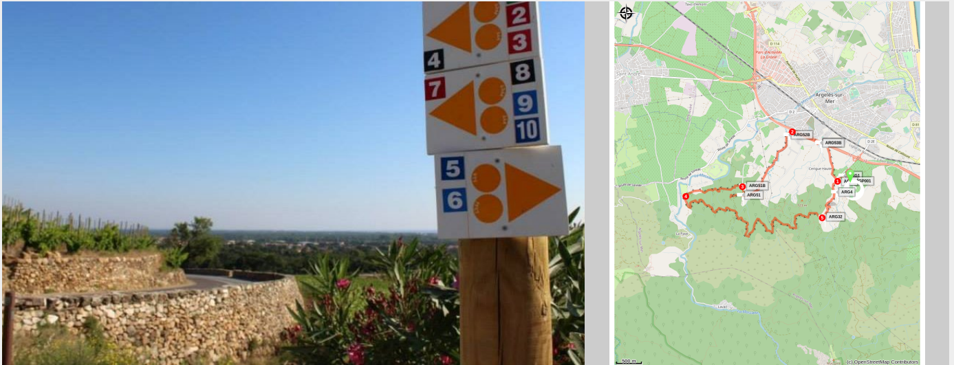
Signalétique VTT (Mairie d'Argelès-sur-Mer)