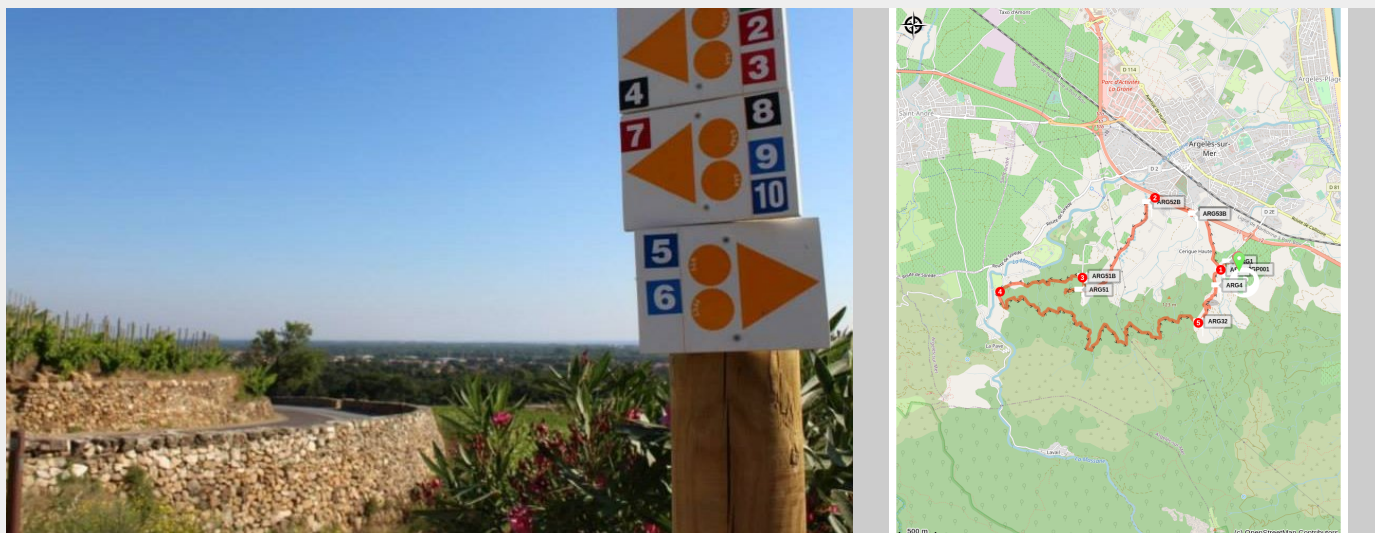
Signalétique VTT (Mairie d'Argelès-sur-Mer)